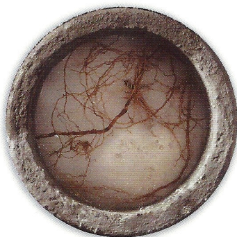
RootX attacks and kills the roots and inhibits regrowth.