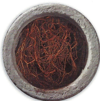
Roots can clog pipes causing blockages and sewer overflows.