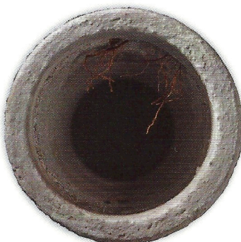
RootX removes virtually all the roots, restoring pipeflow capacity.